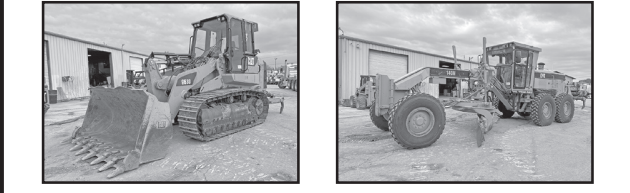
DM1856 '12 CAT 963D track loader DM1855 '06 CAT 140H VHP Plus motor grader

550+ ITEMS SELL NO RESERVE! THURSDAY, DECEMBER 19