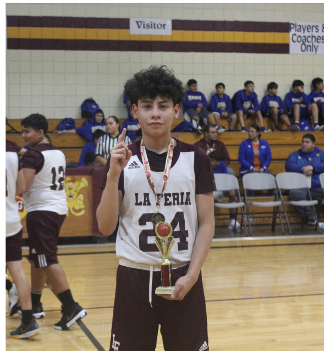
#24 named MVP.