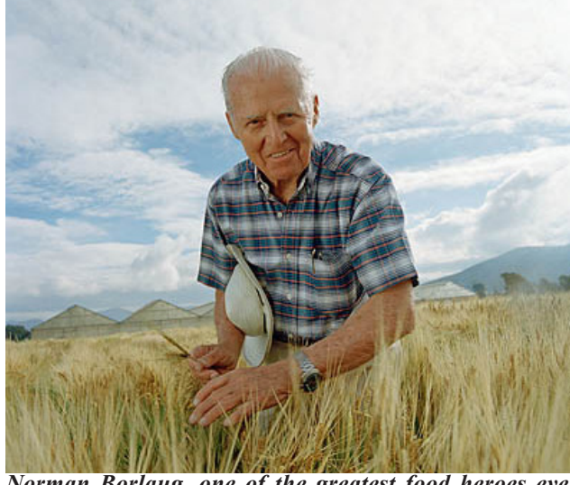
Norman Borlaug, one of the greatest food heroes ever known, perfected a durable and prolific dwarf wheat variety that helped save the lives of an estimated 1 billion people in food-insecure nations of the world.