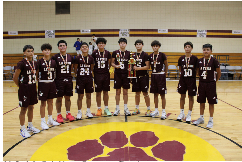
8th Grade La Feria Maroon Tournament Champions.