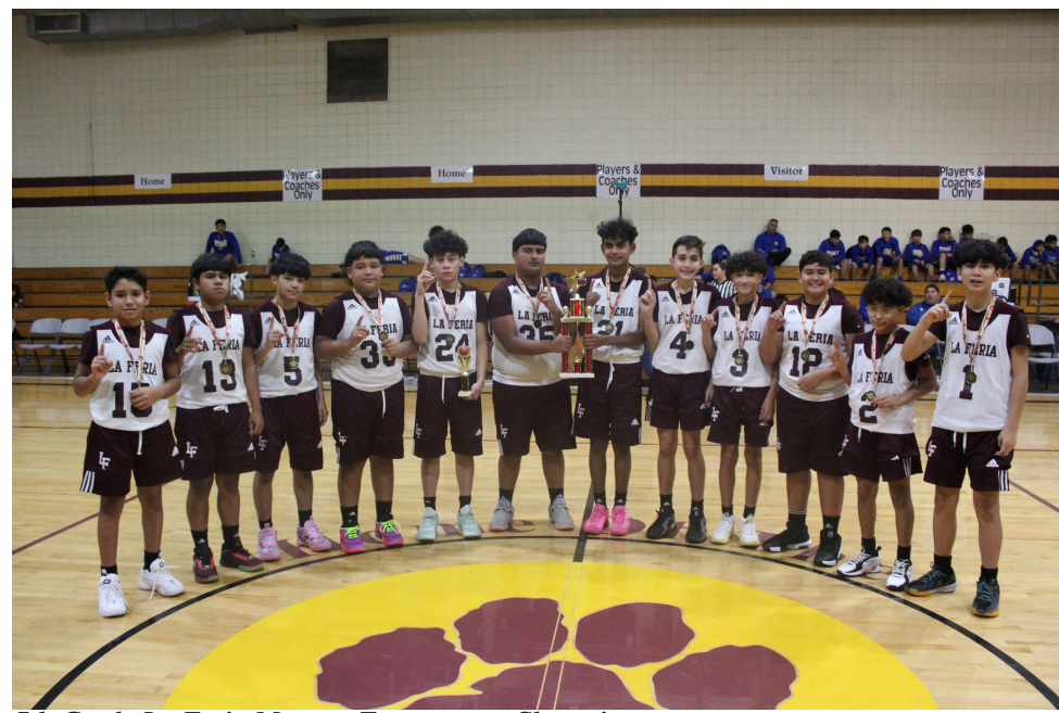
7th Grade La Feria Maroon Tournament Champions.