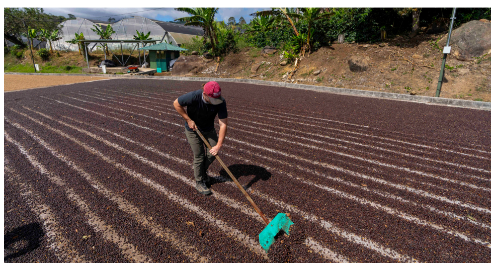
The study abroad group toured Coopetarrazú, a coffee cooperative in Costa Rica, where they saw the inner workings of an active coffee producer.