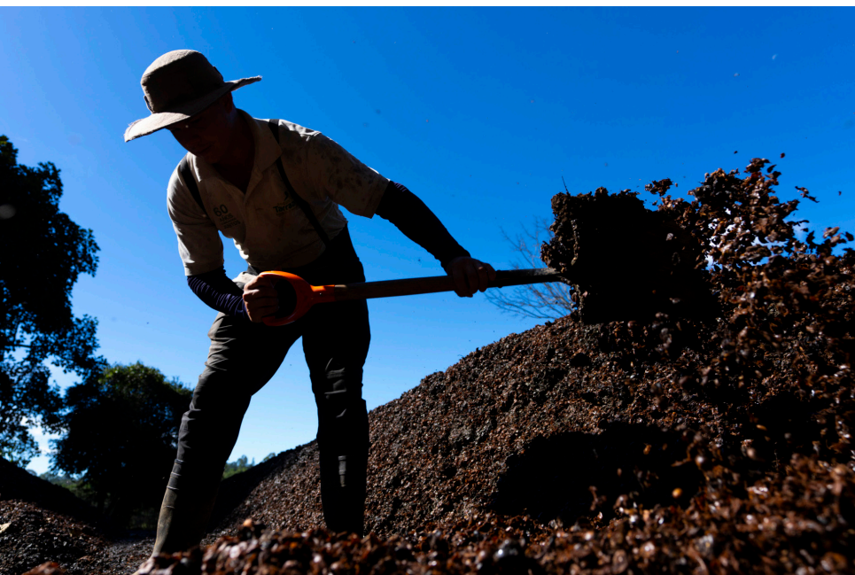
Coopetarrazú uses leftover coffee cherries as compost. The active composting area rivals the size of a football field.